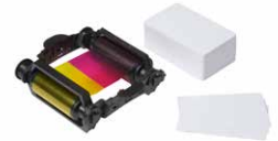
Consumables pack for 100 prints (color ribbon and cards)