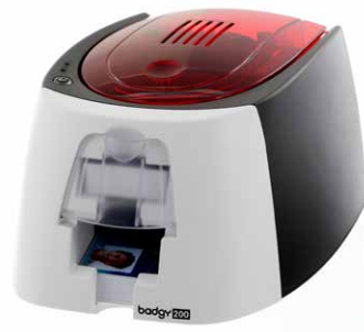
Badgy200 card printer