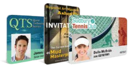
Online card template library