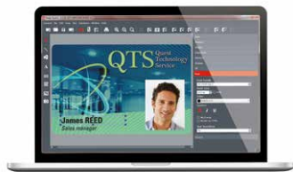
Evolis Badge Studio®+ card personalization software (including import from databases)